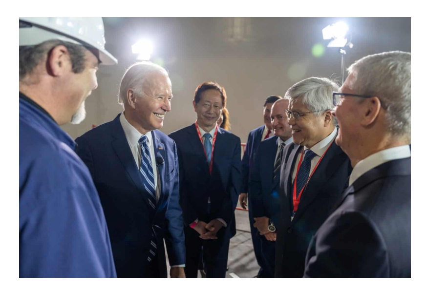
President Joe Biden with <u>TSMC</u> (<a href="https://www.thewirechina.com/2023/03/05/tsmc-turning-point/">https://www.thewirechina.com/2023/03/05/tsmc-turning-point/</a>) officials and other industry executives during their tour of the new TSMC semiconductor plant in Phoenix, Arizona, December 6, 2022.

That would be very useful. To me, the United States' [sanctions on China] are violating international customs for country-to-country relationships. That's detrimental, of course, for China's technological progress, but it is also detrimental for the whole world. It is going to retard technological progress in the whole world.